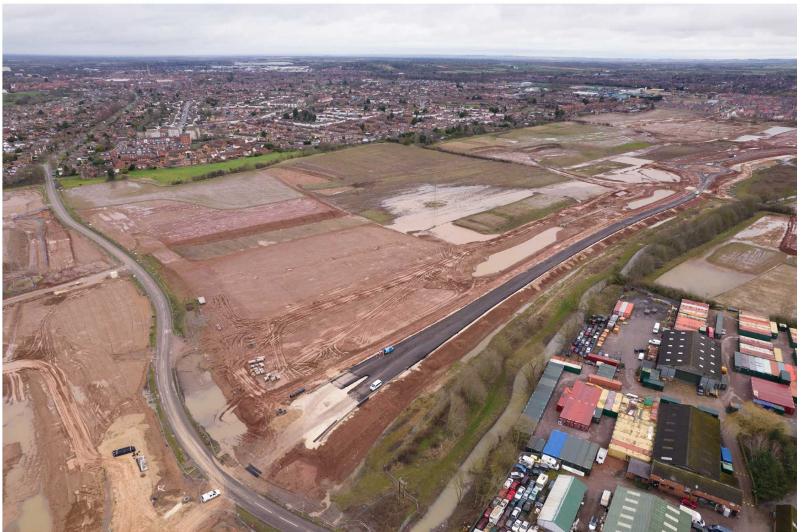
Progress on the road construction with Hawton Road to the left of the picture.

Construction of the bridges to the west of Hawton Road heading over the river Devon and flood plain are scheduled to begin in the spring (weather permitting). You'll see a piling rig on site for the foundations, and there will be periods of a 'pecking' noise during these works. Again, we will monitor this with the contractor as we're required to by the planning consents.