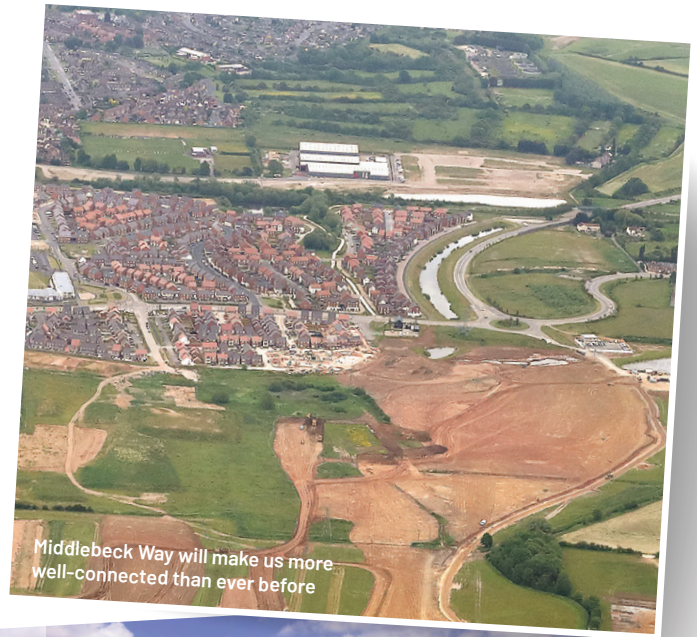
Middlebeck Way will make us more well-connected than ever before