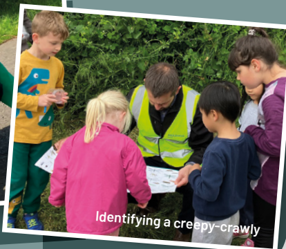
Identifying a creepy-crawly