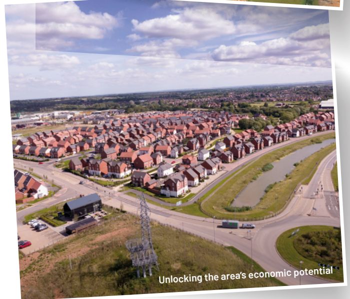
Unlocking the area's economic potential